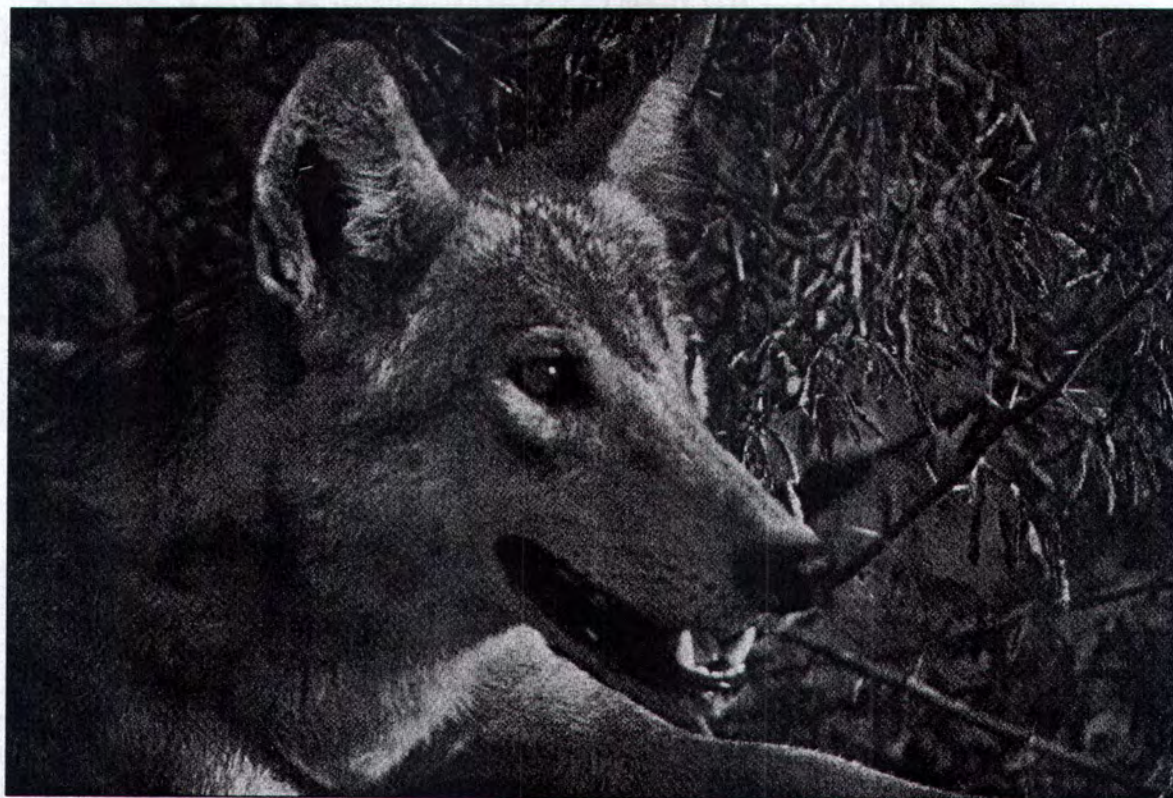
Fig. 1: The Indian wolf represents an ancient lineage of Canis lupus that is unique to peninsular India and parts of Pakistan. Considered to be endangered, its numbers are believed to be between 2,000 to 3,000.